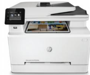
HP Color LaserJet Pro MFP M281fdn/M281fdw