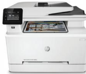
HP Color LaserJet Pro MFP M280nw

Make an impact with high-quality colour and increased productivity. Get the HP's fastest in-class two-sided printing speed and First Page Out Time (FPOT). 1,2 Scan, copy, and fax. Count on simple security solutions, and get easy mobile printing. 3